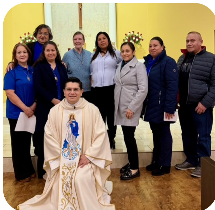
Escuela de agradecimiento San José