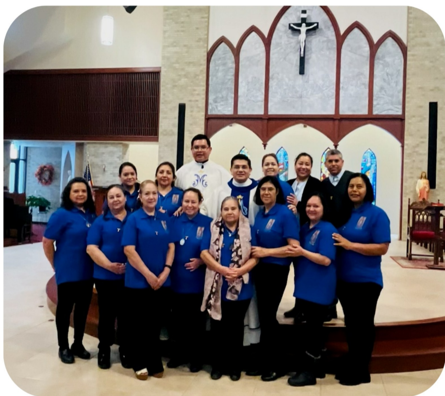
Escuela de agradecimiento Siervas de María

Felicitamos a las tres escuelas de agradecimiento que han renovado sus promesas como misioneros Franciscanas de María.