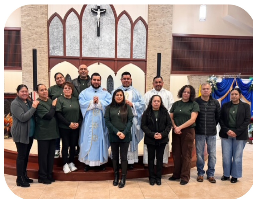
Escuela de agradecimiento Siervos de Jesús - Angola, IN